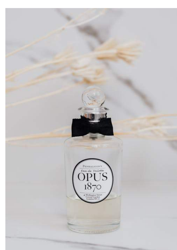
AQUA ALLEGORIA $99