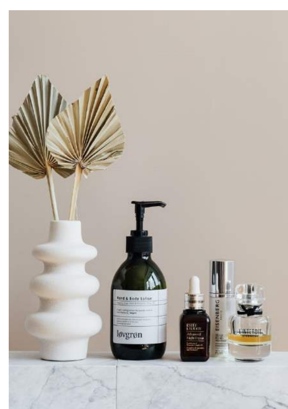
The Fragrance Family Set $99