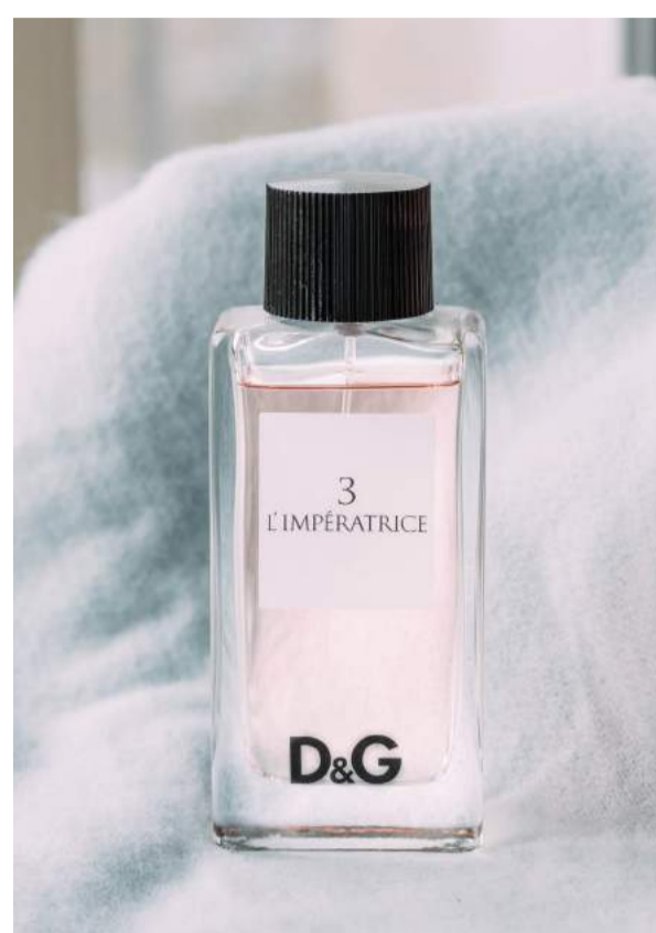
AQUA ALLEGORIA $99