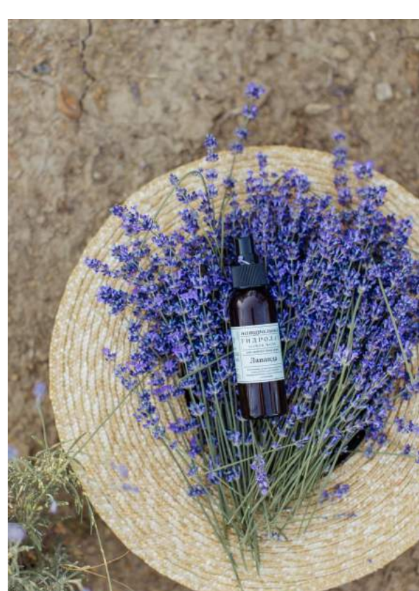
AQUA ALLEGORIA $99