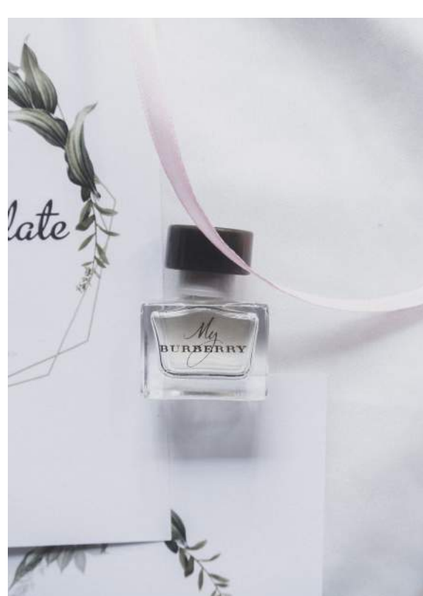
Bottled Heaven $99