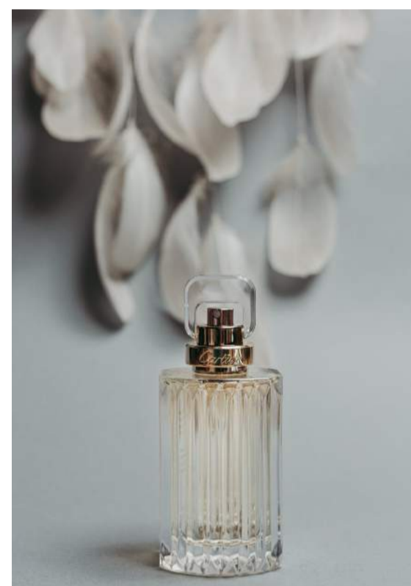
100 Per Scent $99