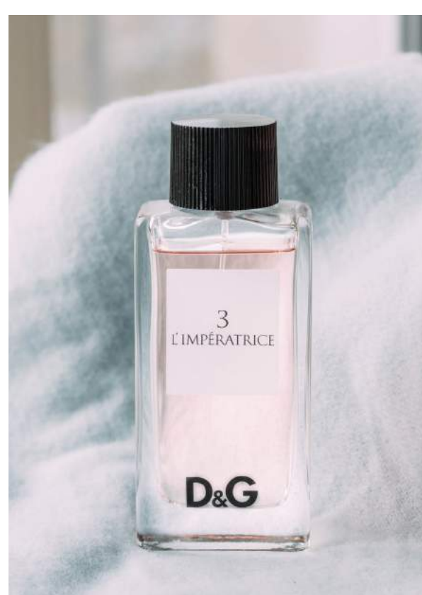
AQUA ALLEGORIA $99