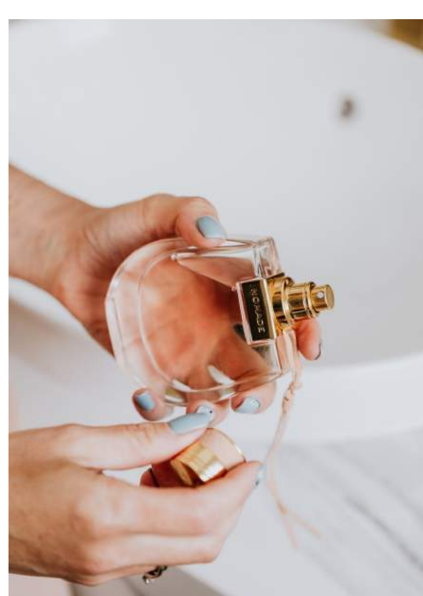
AQUA ALLEGORIA $99