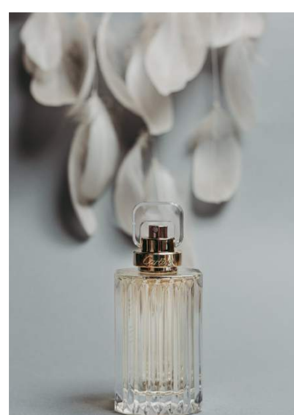
100 Per Scent $99