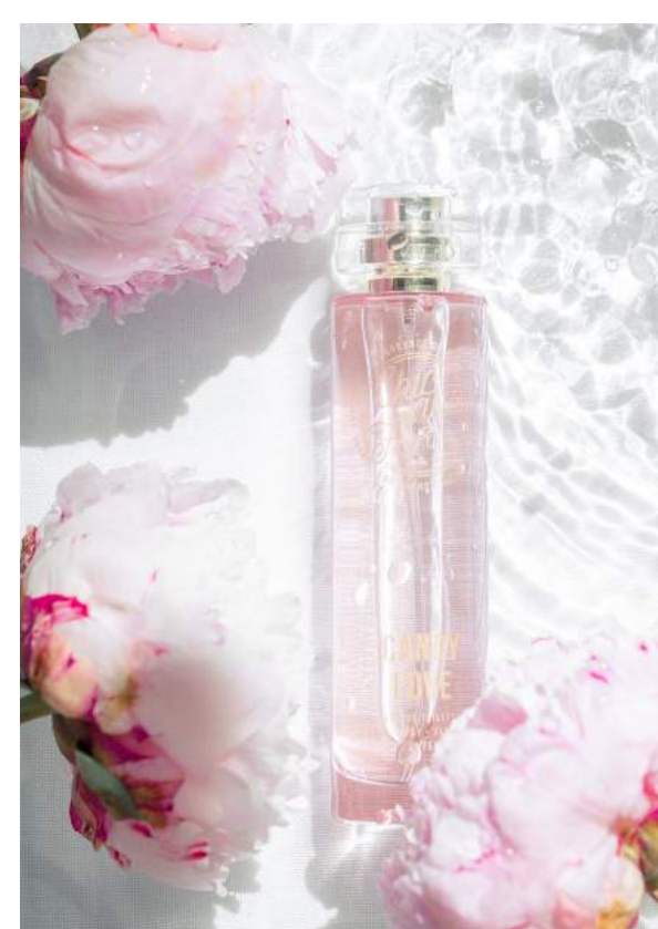
AQUA ALLEGORIA $99