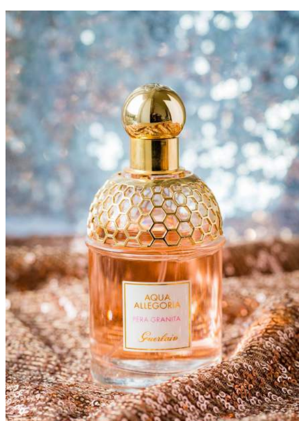
AQUA ALLEGORIA $99

Perfume.Co is an exclusive brand that epitomizes the artistry and passion of handcrafted perfumes. We believe in the power of scents to evoke emotions, memories, and express one's unique personality.