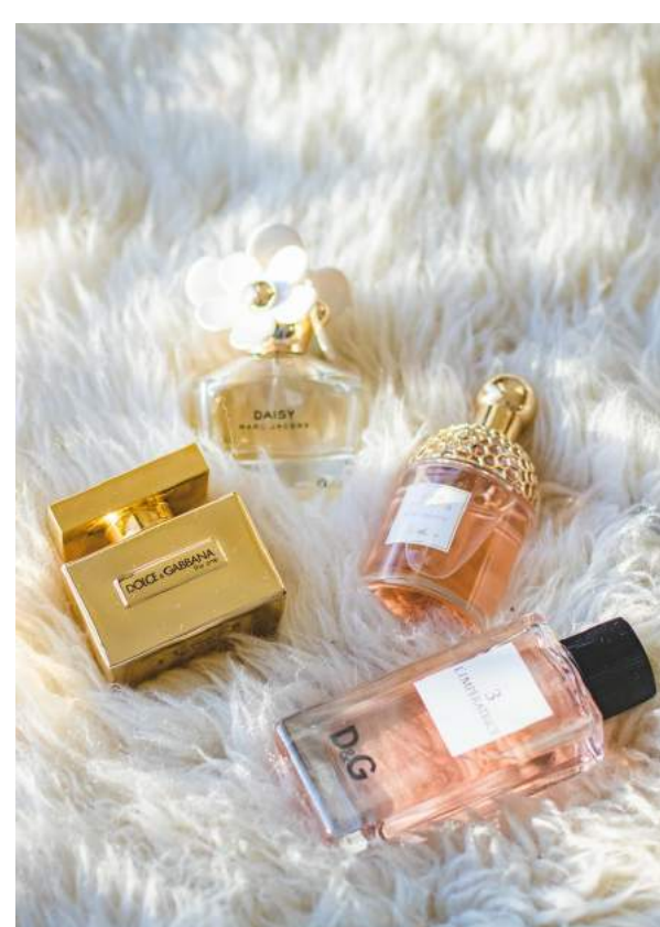
D&G perfume set $99