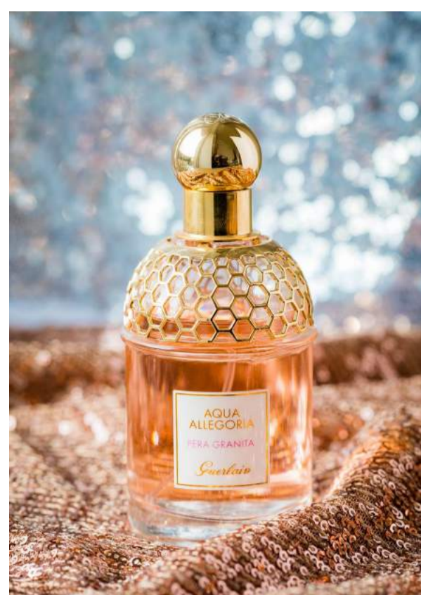
AQUA ALLEGORIA $99