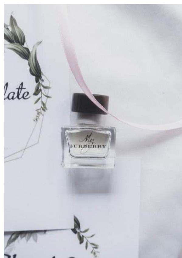
Bottled Heaven $99