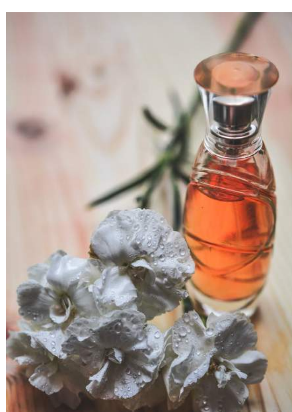
Aromas That Attract $99