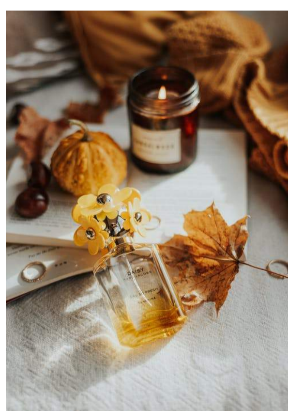
Bottles of Joy Set $99