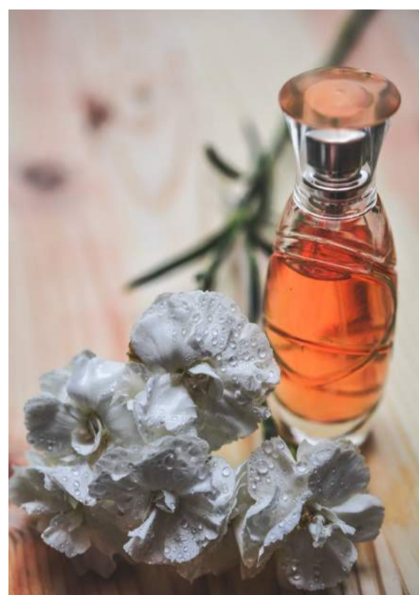
Aromas That Attract $99